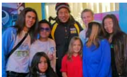
Kā 400 kids with legendary All Black Tana Umaga

The purpose of the Mika Haka Foundation Charitable Trust is to support and encourage in various ways the development and discussion of, and public interaction with, different aspects of native cultures for the benefit of the native cultures and the wider community, and the addressing of various issues of benefit to native cultures and the wider community. In promoting this general purpose the Trust will, without limitation, also: